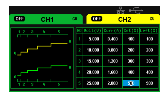
Panel timing output

Through front panel operation, 5 groups of timing settings and output control can be displayed, which provides users a simple power programming function. Also a connection can be made with Siglent's EasyPower PC software providing a full range of communication and control requirements.